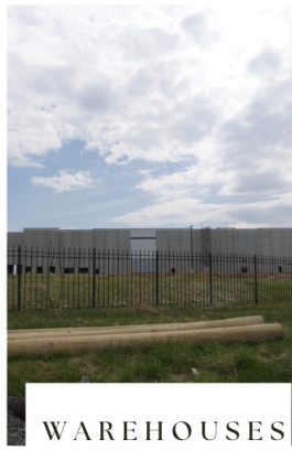
WAREHOUSES ON OLD LINCOLN HIGHWAY