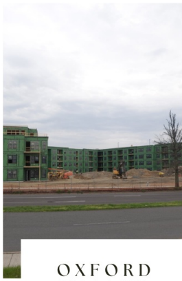
OXFORD VALLEY MALL APARTMENTS