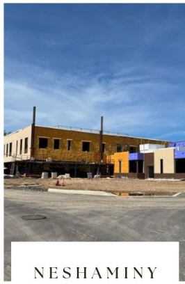
NESHAMINY SCHOOL DISTRICT NEW BUILDING